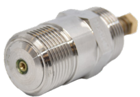
Self cleaning spring loaded nozzle

IEP Technologies - South East Asia (HOERBIGER Safety Solutions) Tel: +65 6890 0770