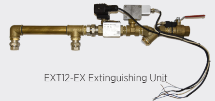
EXT12-EX Extinguishing Unit