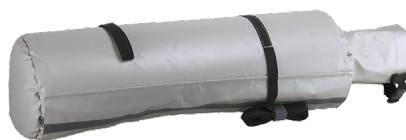
Insulation jacket of extinguishing unit