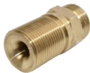
High flow nozzle