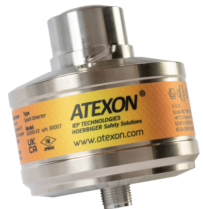
SD300-EX Spark Detector

To learn more about Industrial Explosion Protection or to find your local IEP sales, service, and support center visit www.ieptechnologies.com or contact +1 855-793-8407.